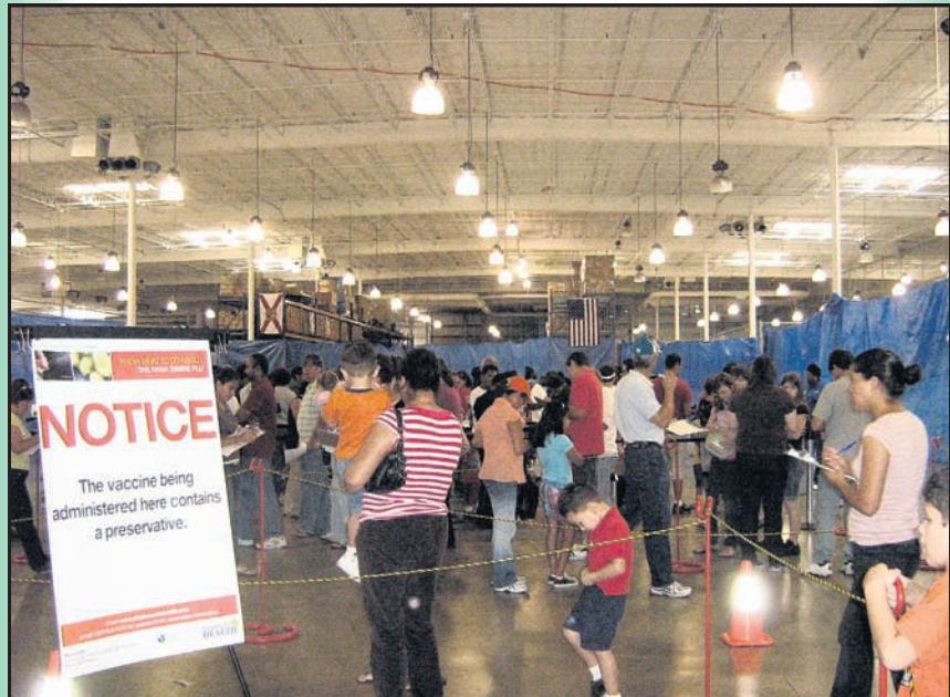
Residents of St. Lucie County lined up on the first day of free H1N1 shots provided by the St. Lucie County Health Department on Oct. 26, 2009.

The H1N1 vaccination campaign responded to the world's first flu pandemic since 1976. The Health Department received over 90,000 doses of flu vaccine which were distributed to CDC designated priority groups through 79 local physicians and countywide mass vaccination stations. This campaign, funded by a Federal emergency grant, was a community effort involving county administration, public safety, law enforcement, fire district, school district, Ft Pierce and Port St Lucie, Lawnwood Regional and St Lucie Medical Centers, and Indian River State College. A wide-ranging plan was prepared to effectively and efficiently communicate key H1N1 messages to the public, healthcare providers, government agencies and private businesses. Dozens of press conferences, training sessions, symposiums, media briefings and print advertisements were developed to target St. Lucie County residents that were at highest risk of severe complications to H1N1 and to keep the communication lines open with partners and the public.